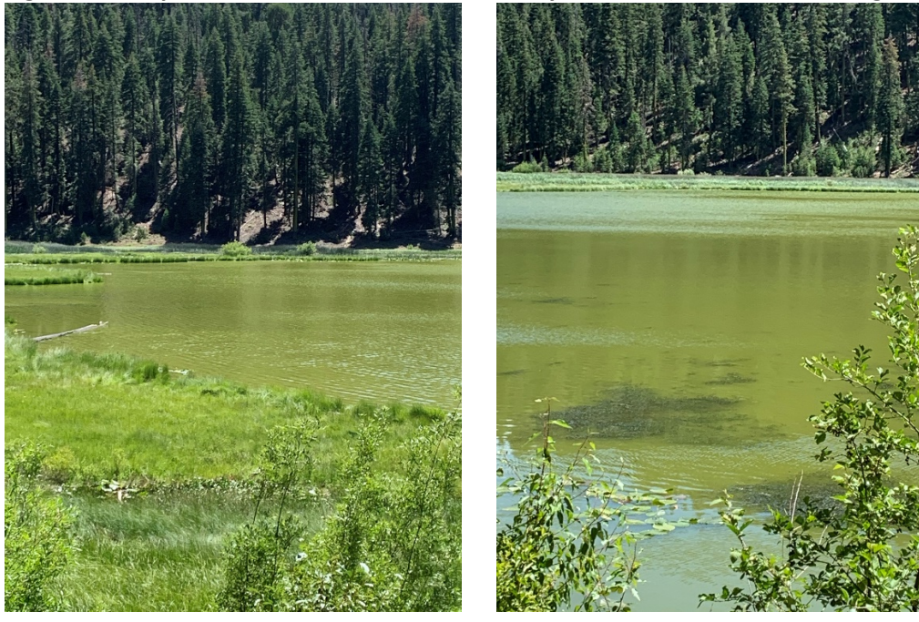
Figure 2. Site photos of Willow Lake taken on July 15, 2019

On July 15, 2019 US Forest Service staff visited Willow Lake based on a public complaint concerning water conditions. During the staff visit, staff noted that the water appearance looked like pea soup. Water samples were collected for performing the jar test. The jar test was positive, so site photos and results of the jar test were sent to the Water Boards for assessment along with a request for assistance in analysis.