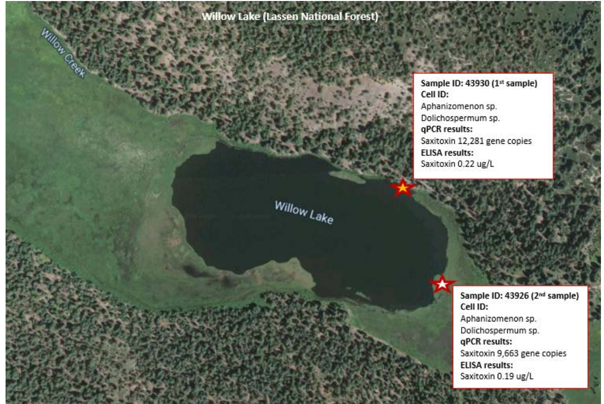
Figure 1. Map of Willow Lake in the Lassen National Forest (Plumas County) showing the location where two surface water samples were collected for cell id, and toxin testing.

Ultimately, the advisory signs, if any, posted at the water body will need to be decided by the US Forest Service in consultation with the Plumas County Environmental and Public Health offices. At a minimum, all recreational users should be encouraged to practice <u>healthy habits</u> when recreating in waters known to experience HABs.