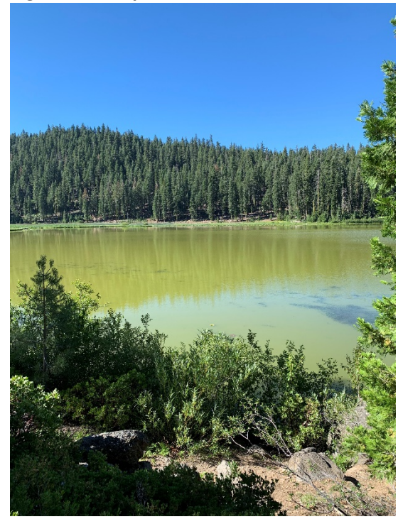
Figure 3. Site photo of Willow Lake taken on July 22, 2019