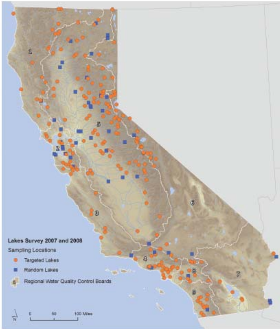
Figure 1. Map of sampling locations xx placeholder below