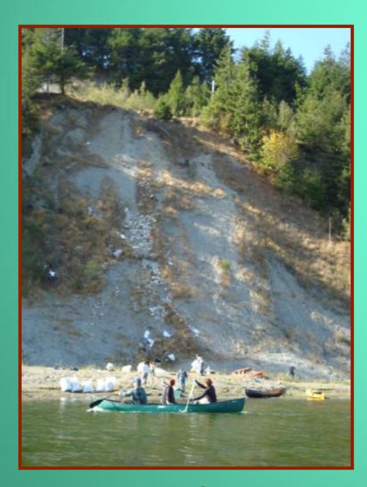
Eel River Clean Up

Corpsmembers engage community members in hands-on watershed restoration through the coordination of Individual Service Projects (ISPs)