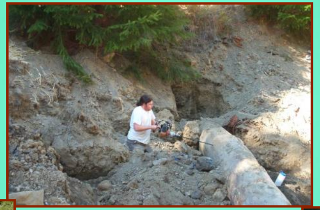
In-stream Structure Implementation