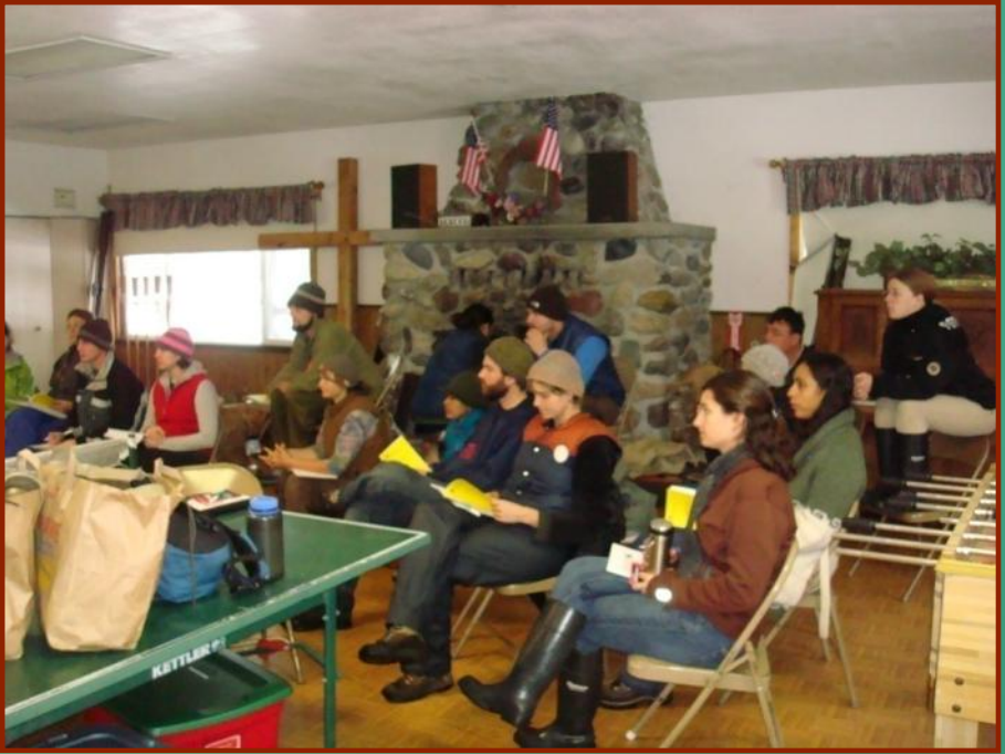
Swiftwater Safety Training