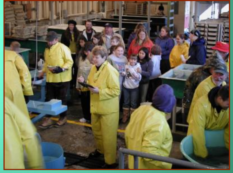
Creek Days Environmental Education Fair