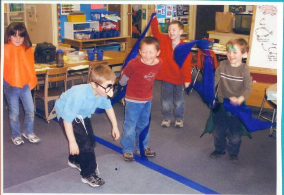
Egg to Fry Exhibit