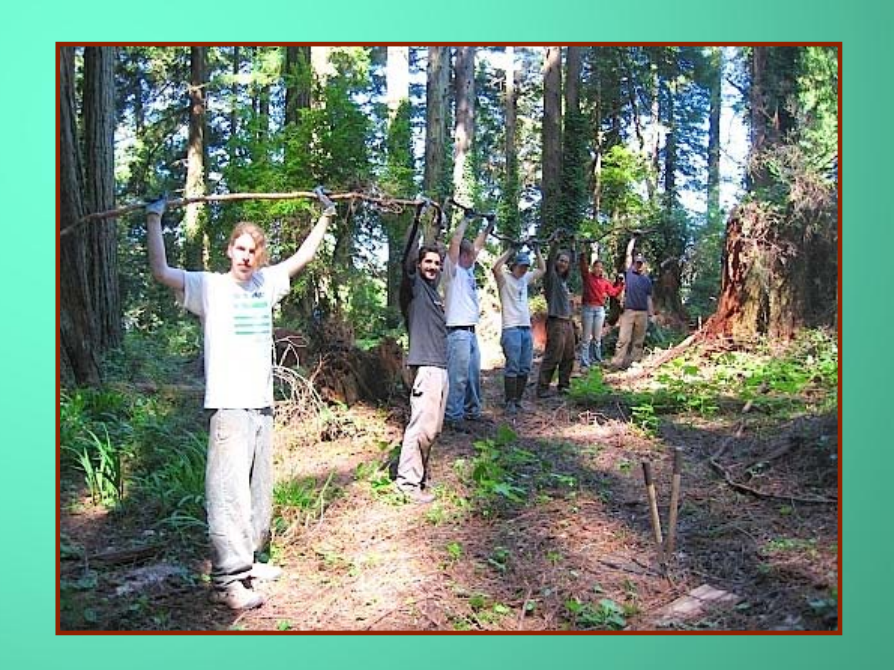
Invasive English Ivy Removal