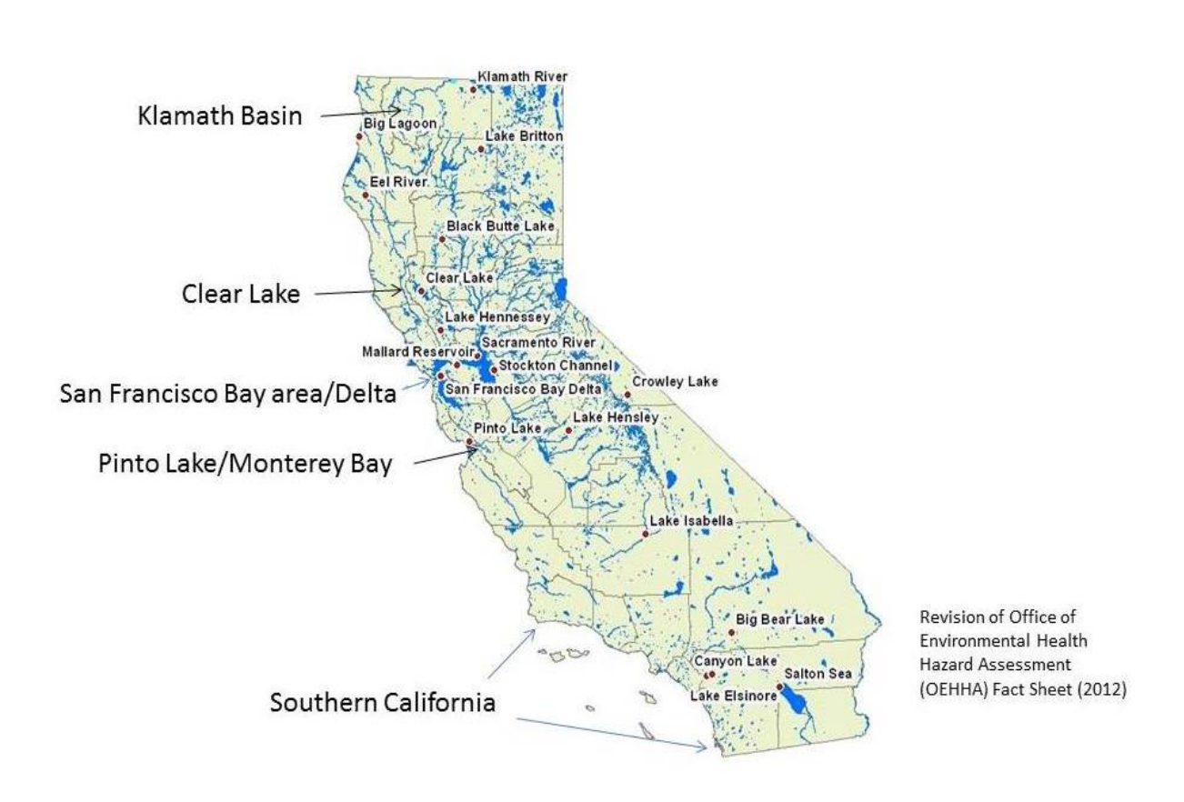
Figure 3. Areas in California with recurrent blooms and ongoing monitoring activities

In 2014, there were so many cyanoHAB blooms in coastal habitats reported to the San Diego Regional Water Board that an ad hoc field survey was conducted of estuaries, lagoons, lakes, and reservoirs. Microcystins were detected at several lakes at varying concentrations and microscopic examination of water samples indicated multiple, potentially toxic species at the sites sampled. Four lakes in Riverside, CA were sampled in the spring of 2014 and multiple toxins were detected simultaneously, including cylindrospermopsin, anatoxin-a and microcystins, with several samples containing cyanotoxin concentrations above recreational action level thresholds (see Appendix C for OEHHA action level thresholds). Additionally, four lakes in the Los Angeles and Orange County areas have experienced costly fish kills, attributed to blooms of the toxin producing golden algae, Prynmesium parvum .